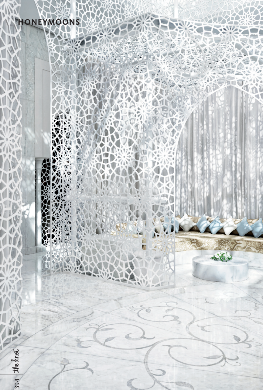
394 | The Knot